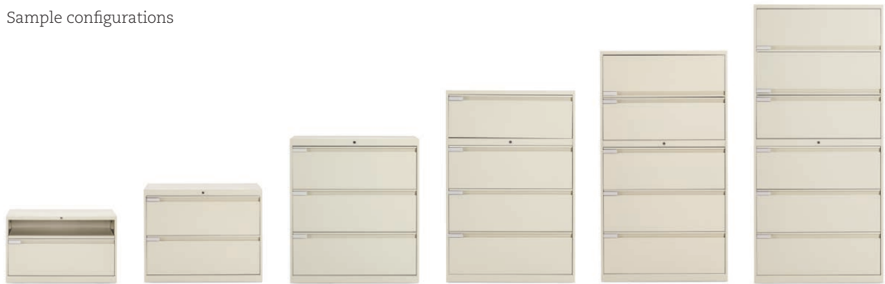
1½ h Storage Cabinet with File Drawer and Open Shelf