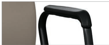
Self-skinned urethane (SSU) armcaps offer a stable comfortable grip, available in all Globalcare finishes