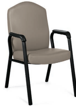
Low fixed back armchair

Adeline™ chairs are an ideal solution for patient room, ambulatory care and emergency area applications. High density Ultracell foam cushions offer long life and comfort when sitting for extended periods. An environmentally friendly powder coated steel frame