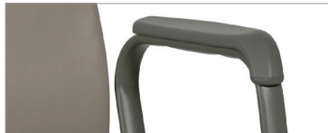
Oval tube steel frame, available in all Globalcare finishes