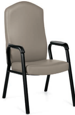
High flex back armchair (18" seat height)