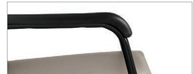
The powder coated steel frame is strong and durable