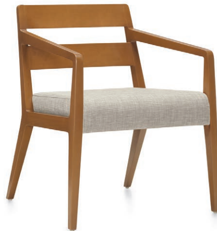
Wood back armchair with upholstered waterfall front seat