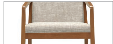
Wood front rail