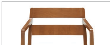
Wood back armchair