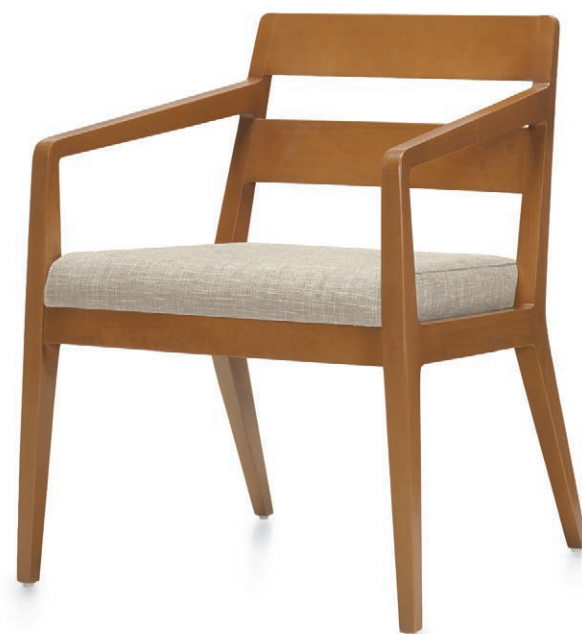
Wood back armchair with wood front rail

Chap™ brings mid-century modern influence to lounges, offices and casual meeting areas. Finely crafted with European Beechwood, guest seating is available in two back styles: full frame open back or fully upholstered. Choose from a selection of stain finishes or an option for custom color matching.