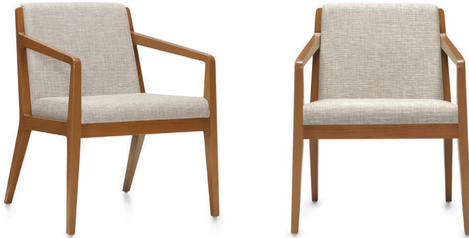
Upholstered back armchair with wood front rail

The wall saver design features rear legs that extend past the seat back to ensure wall clearance. Designed by Chris Carter, Chap complements our Corby™ collection at a competitive price point.