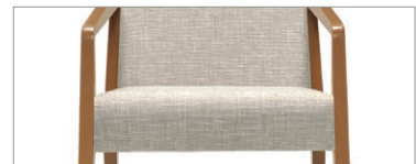
Upholstered waterfall front seat