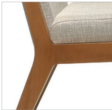
Wall saver frame