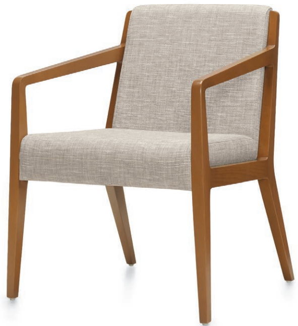
Upholstered back armchair with upholstered waterfall front seat

An upholstered model gives Chap a tailored appearance. Choose from fabric, vinyl or leather upholstery that extends from the gently sloped seat to the back of the armchair.