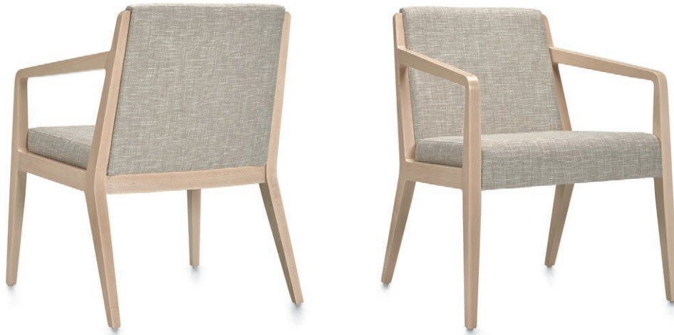
Upholstered back armchair with upholstered waterfall front seat