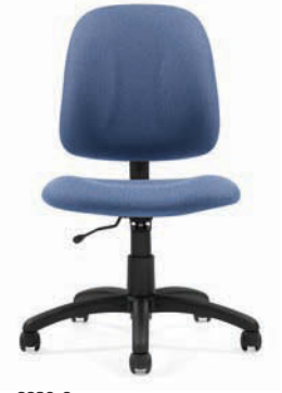
2239-6 Low Back Task (armless)