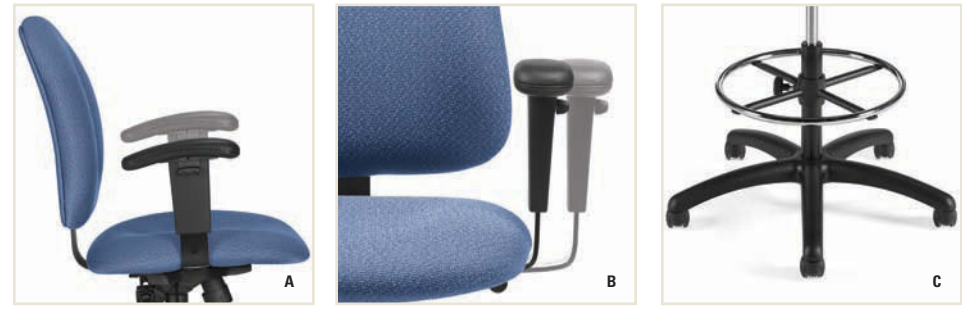
Goal is ergonomically engineered for maximum comfort. Goal features a high back design, lumbar support, substantial seat and back cushioning and a wide range of adjustment options.

A. (3N) height adjustable curved T-arms are standard. B. Optional arm width adjustment allows for an extra 2" overall seat width. C. Models 2235-6 and 2236-6 feature an adjustable chrome footring.