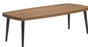
3400 48"W X 22"D X 15"H