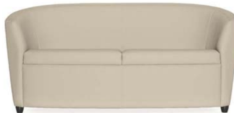
3373 TWO SEAT SOFA