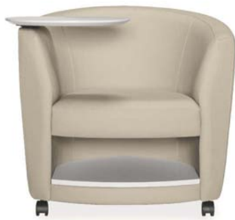
3372RTMC CLUB CHAIR WITH RIGHT SIDE TABLE AND BOOKSHELF