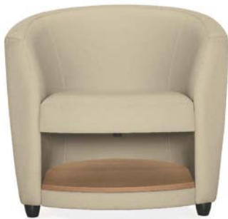
3372 CLUB CHAIR WITH BOOKSHELF

The very popular Sirena series has been expanded to include tablet arms, two and three seat sofas, and club chairs with casters and/or bookshelves. A complete line of complementary tables are also being introduced.