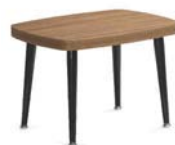
3402 17"W X 22"D X 15"H