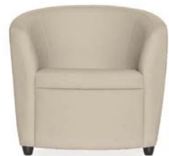
3371 CLUB CHAIR