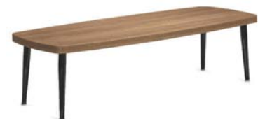
3401 56"W X 22"D X 15"H