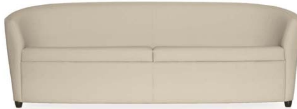
3374 THREE SEAT SOFA