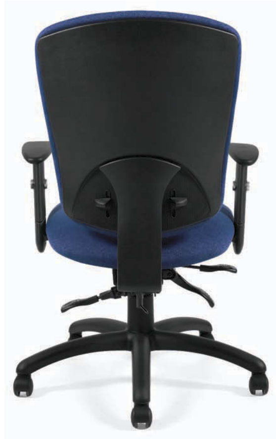
5333-3 High Back Multi-Tilter