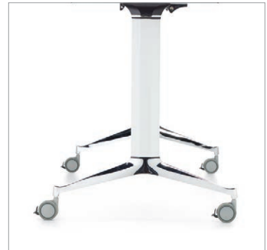
Leg column and cross beam available in a full range of finishes (Designer White shown). Foot is standard in Polished Aluminum