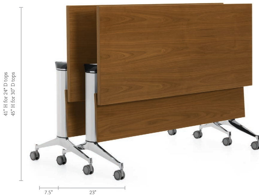
Optional modesty panel articulates with table top in upright position.