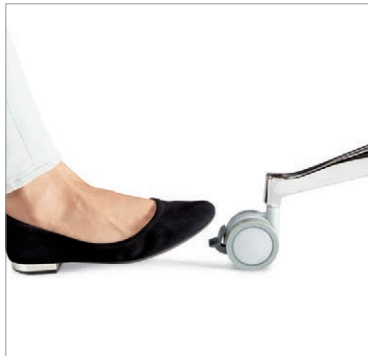
Locking dual wheel casters swivel 360°