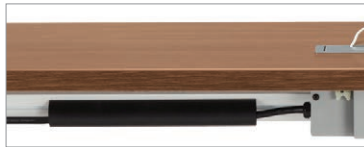
Optional wire management snap-in channel