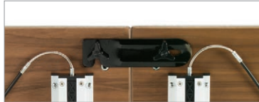
Optional ganging plates