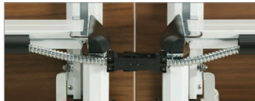
Optional daisy chain power management