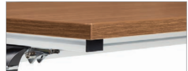
Table tops available in a large variety of laminate finishes (Walnut Heights shown)