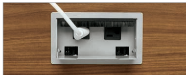
Optional power block includes power and data