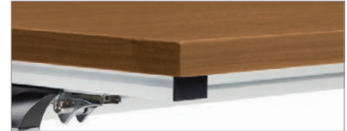
Table tops available in a large variety of veneer finishes (Latte Walnut shown)