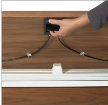
One handed flip up operation